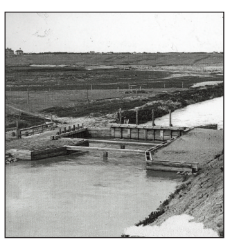
Irrigation canal southwest of Lethbridge, 1911.

Seeing the success of what was occurring, the Alberta